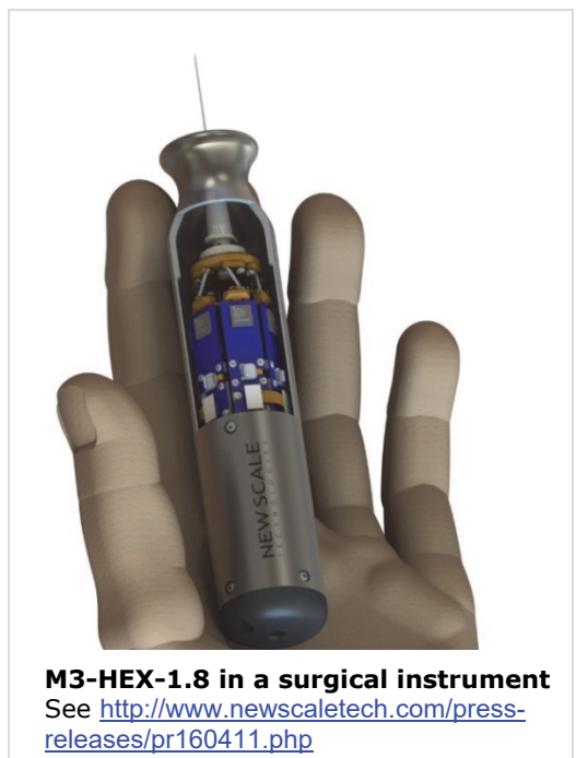
M3-HEX-1.8 in a surgical instrument See http://www.newscaletech.com/press-releases/pr160411.php